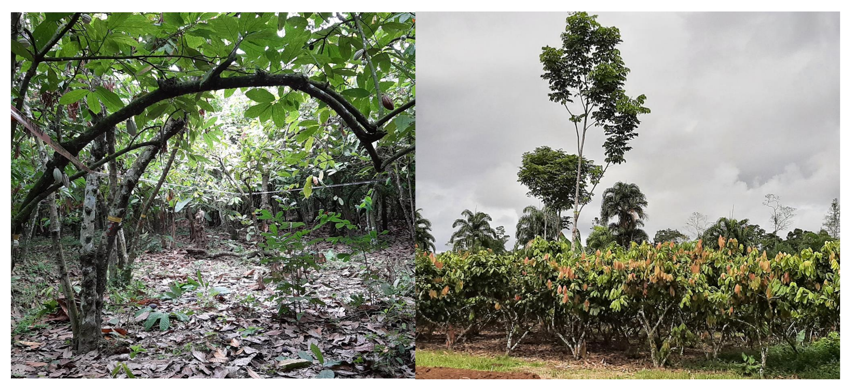
Figure 2. Organic agroforestry farm in the Guayas province of Ecuador on the right, agroforestry long-term field experiment in the Ecuadorian Amazon (INIAP).

Case studies for framework testing- Ecuador