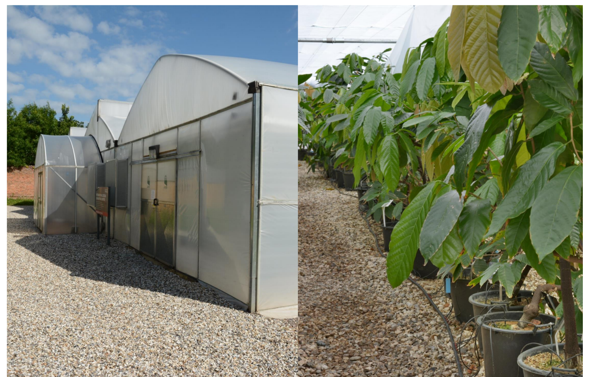
The International Cocoa Quarantine Centre greenhouse facilities